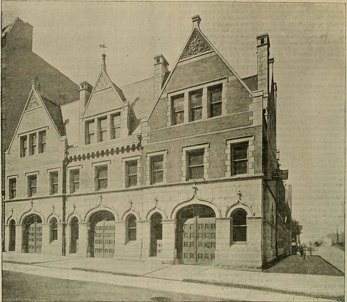
50th and 51st Streets and Park Avenue.