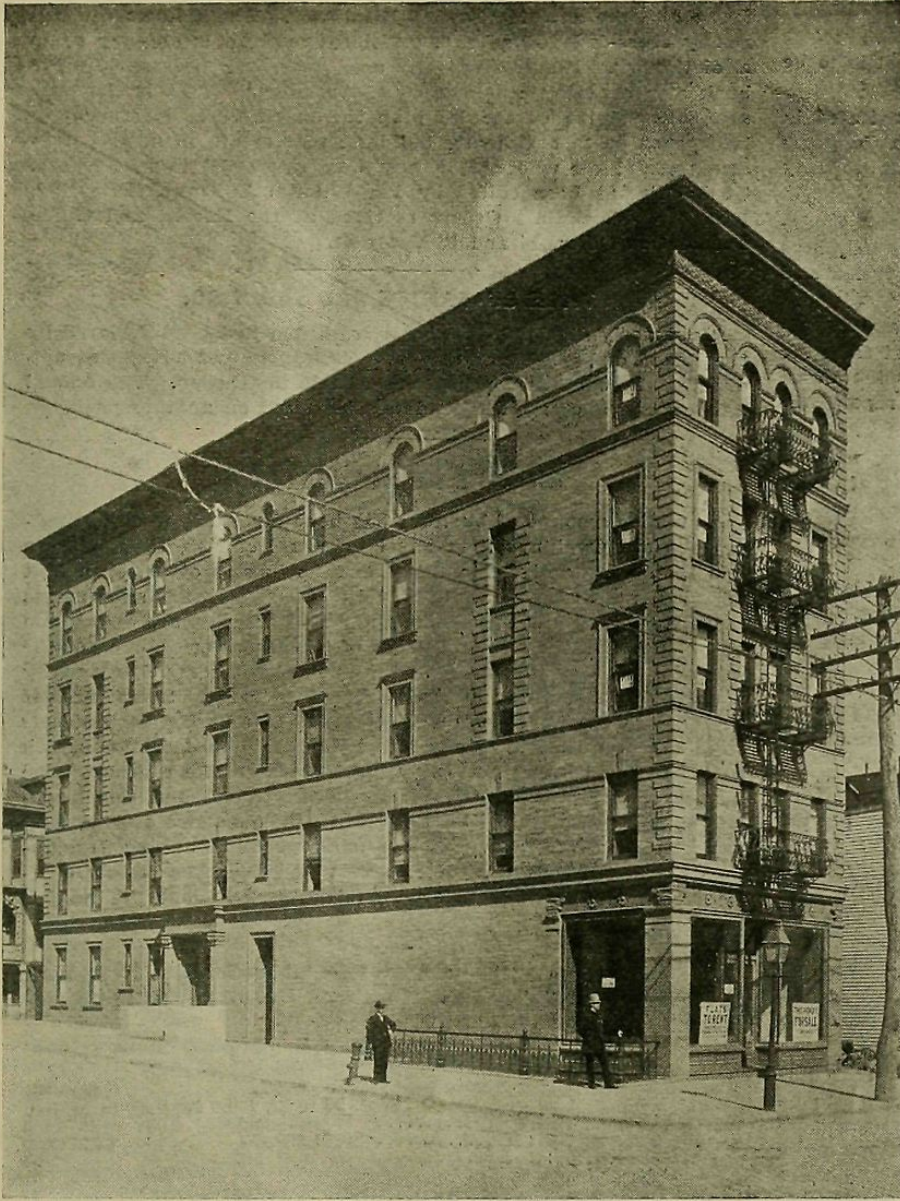
NEW STORE AND APARTMENT BUILDING.

Northwest Corner 166th Street and Amsterdam Avenue.