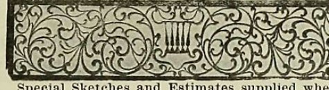
Special Sketches and Estimates supplied when desired.

T. H. MÜLLER, CONSULTING ENGINEER, structural work. Steam Power and Pumping Plants. Factory Buildings. 72 WEST 131st STREET, NEW YORK.