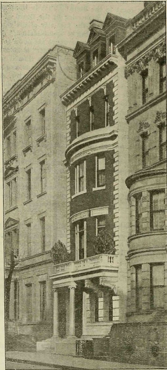
FIGURE ONE OF THE NEW HOUSES ON WEST 54TH ST.

○ F the huge and massive University Club itself it is too soon to speak definitely or in detail. The effect that is arrived at in it is the effect of magnitude and simplicity that is made by the early Florentine palaces, an effect produced by "scale" of parts and cyclopean massiveness of masonry. Here the scale is attained by presenting some nine actual stories in three visible stages; but that it is attained there can be no question. What is for more immediate consideration is the tremendous