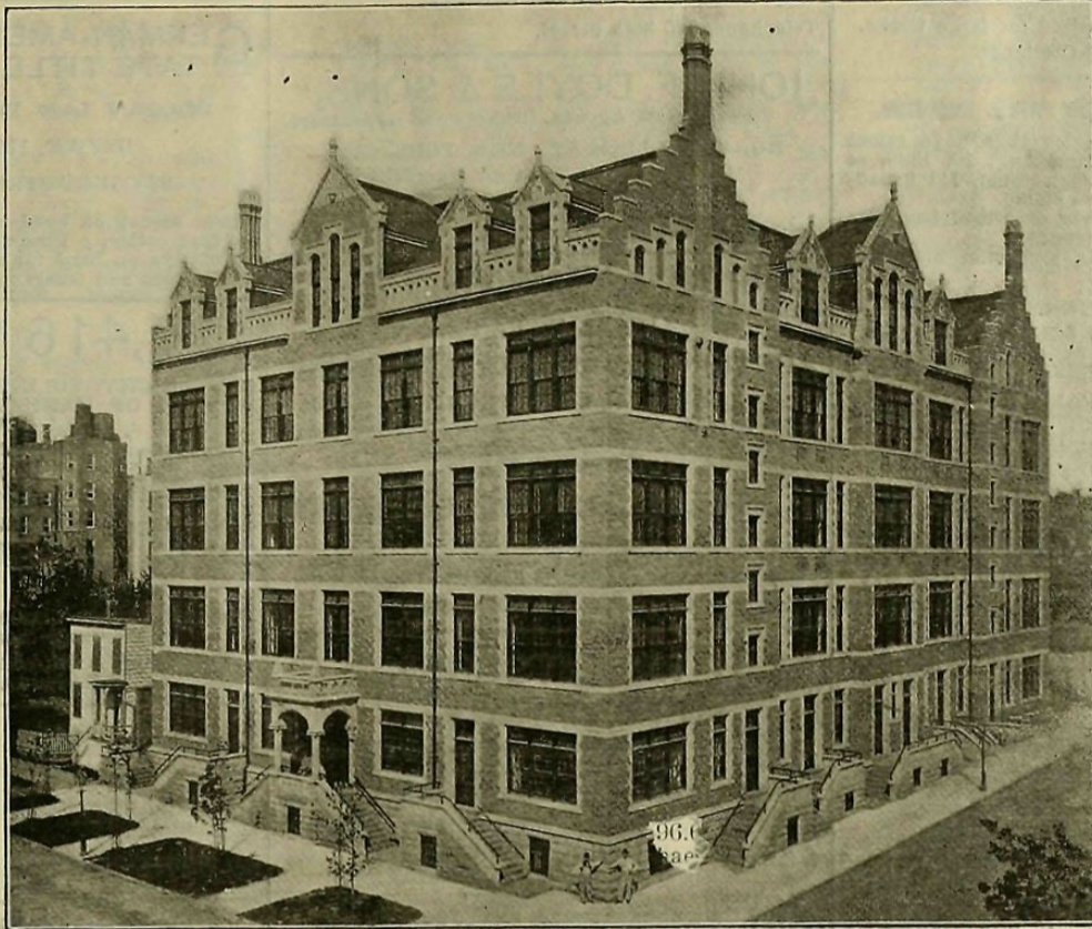
PUBLIC SCHOOL, ST. NICHOLAS AVENUE AND 117TH STREET.