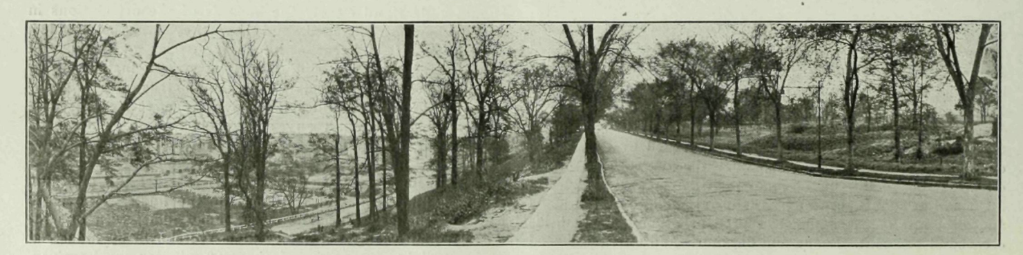
BENNETT ESTATE, LOOKING SOUTH ON FORT WASHINGTON AVENUE.

Once the impending "building boom" breaks, and is gotten under way, every builder of note in New York will want a "Bennett Estate" building site. Buyers at the sale next Tuesday, June 10, will then be in a fine position to pocket a comfortable profit, that is, unless all of the buyers on that memorable day are building loan operators and builders.