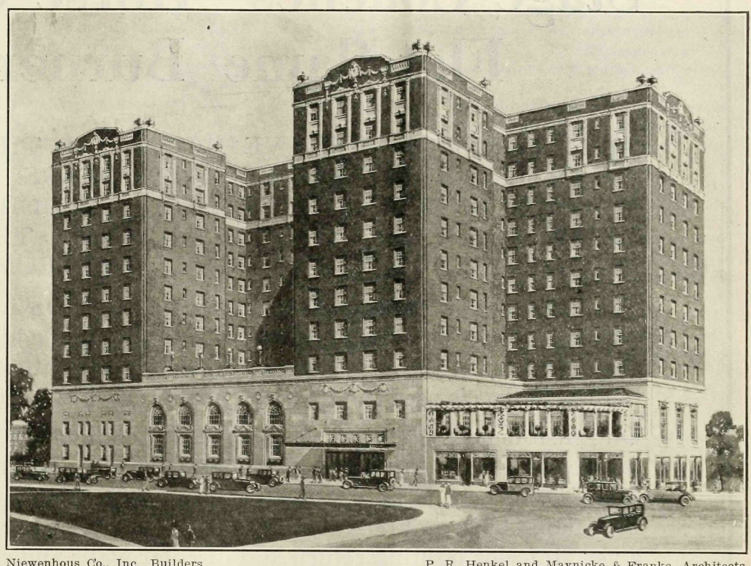
Niewenhous Co., Inc., Builders

The main entrance will be on the Concourse and in addition