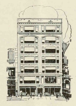
28-30 WEST 57th STREET

A seven story building, incorporating all the latest improvements with special arrangements made for well lighted showrooms and lofts.